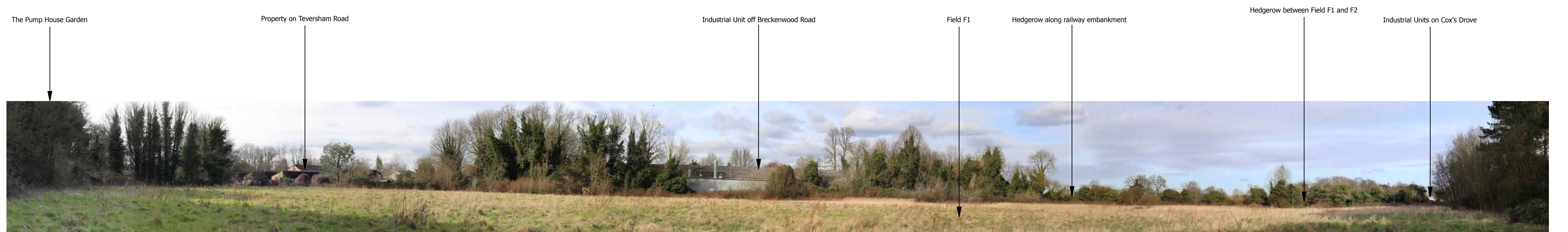
SITE APPRAISAL PHOTOGRAPH F