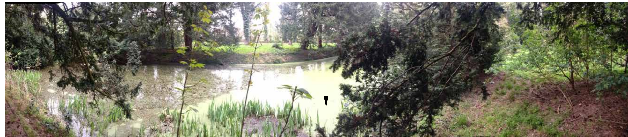
SITE APPRAISAL PHOTOGRAPH K

Pond within garden associated with former Fulbourn Pumping