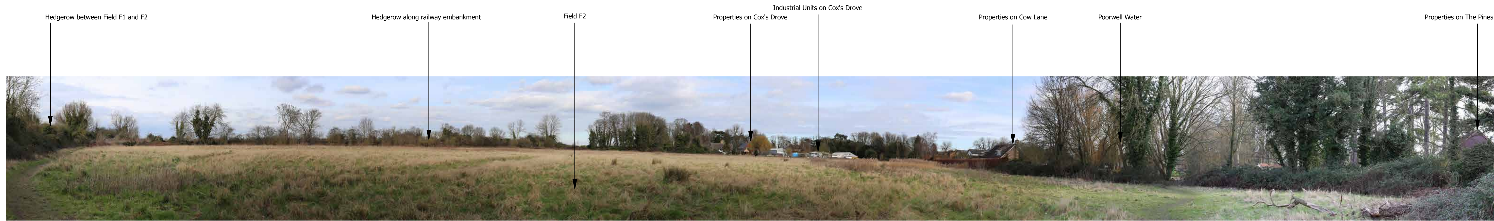
SITE APPRAISAL PHOTOGRAPH D