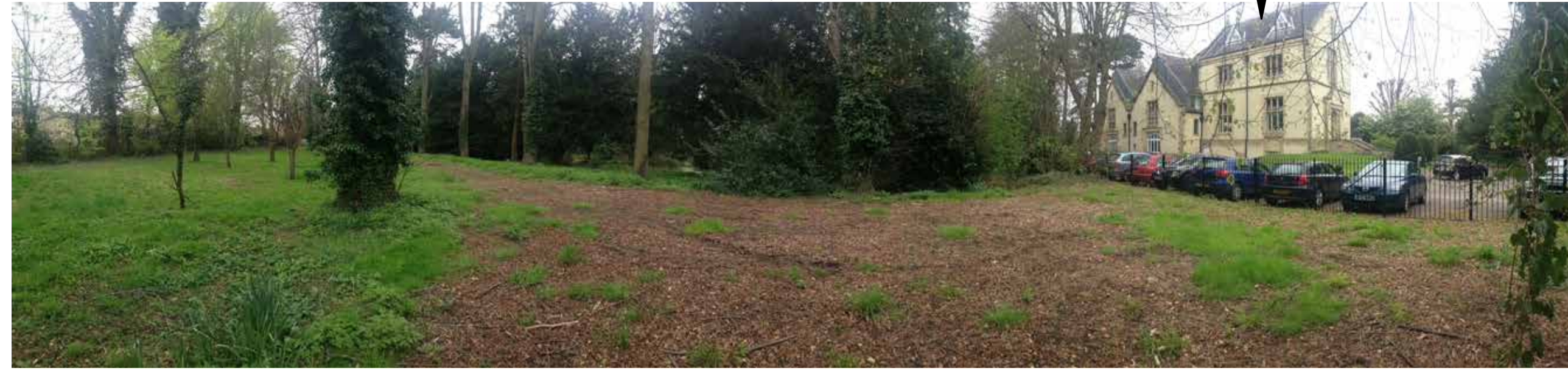
SITE APPRAISAL PHOTOGRAPH I