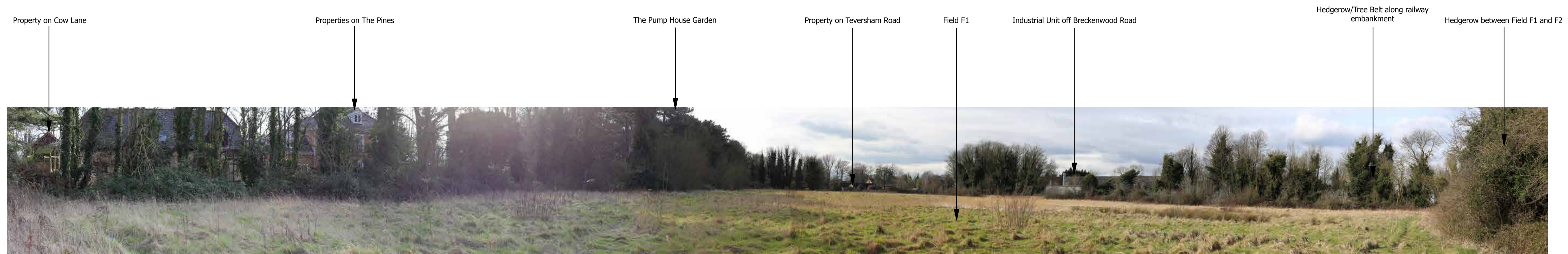
SITE APPRAISAL PHOTOGRAPH E