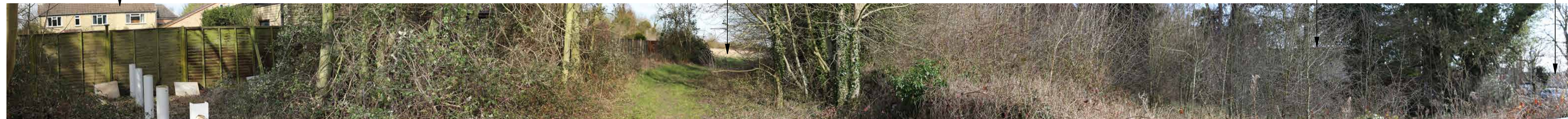
SITE APPRAISAL PHOTOGRAPH H

Property on Teversham Road Field F1 The Gate Lodge Properties Hinton Road