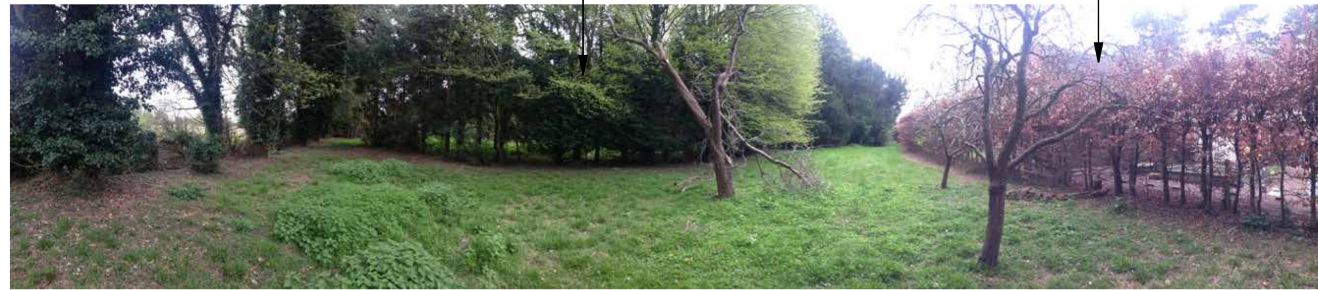
SITE APPRAISAL PHOTOGRAPH J

Glimpsed view at properties on Teversham Road