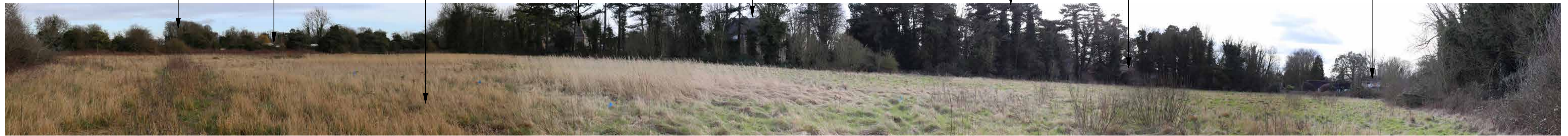
SITE APPRAISAL PHOTOGRAPH G

Hedgerow between Field F1 and F2 Properties on Cox's Drove Field F1 Property on The Pines Former Fulbourn Pumping Station The Pump House Garden The Gate Lodge Property on Teversham Road