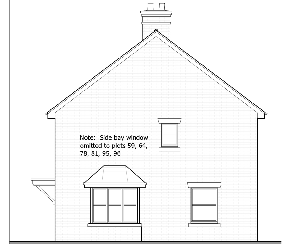
SIDE ELEVATION 1 VARIANT WITH BAY TO PLOT 57 ONLY

Note: Side bay window omitted to plots 59, 64, 78, 81, 95, 96