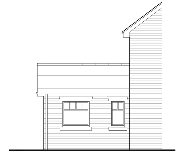
SIDE ELEVATION 3