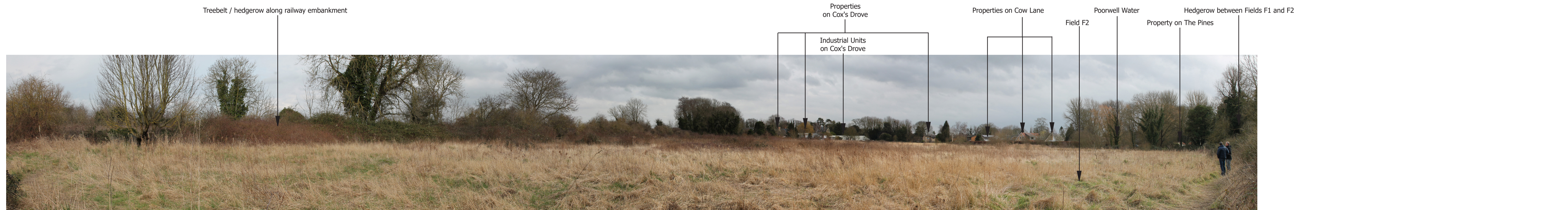
APPEAL SITE APPRAISAL PHOTOGRAPH C