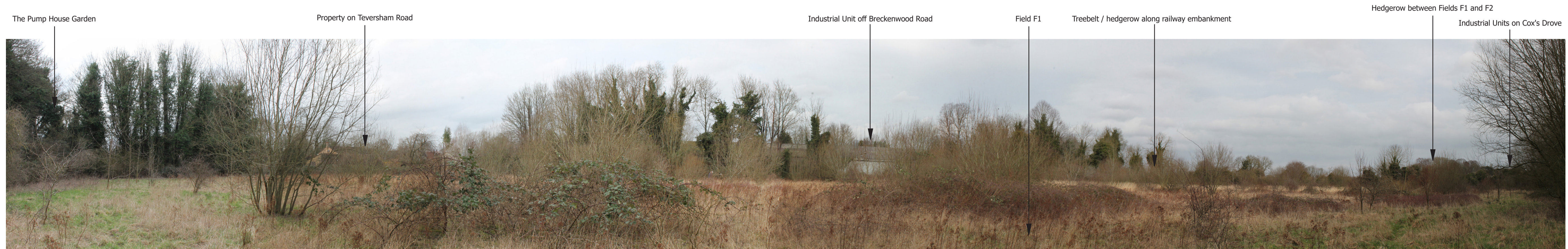
APPEAL SITE APPRAISAL PHOTOGRAPH F