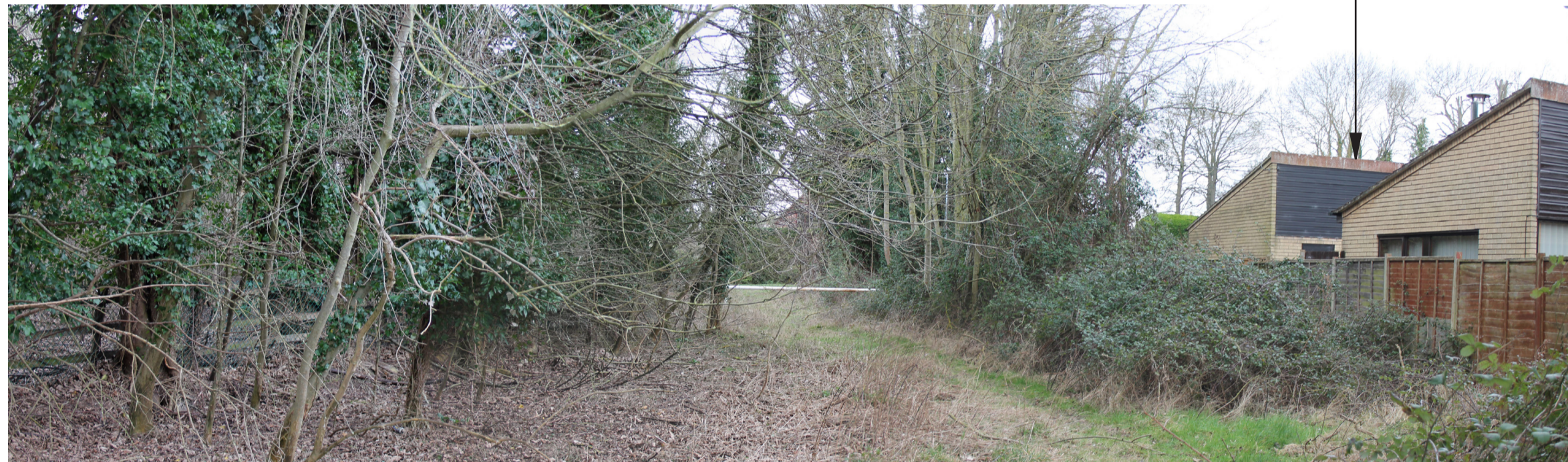
SITE APPRAISAL PHOTOGRAPH H: