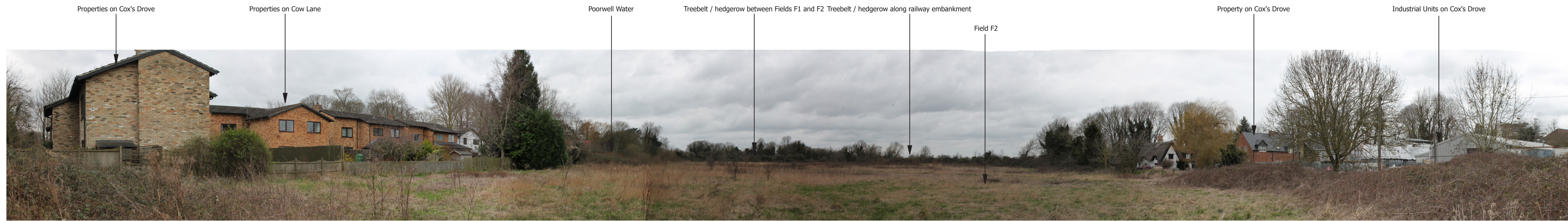
APPEAL SITE APPRAISAL PHOTOGRAPH A