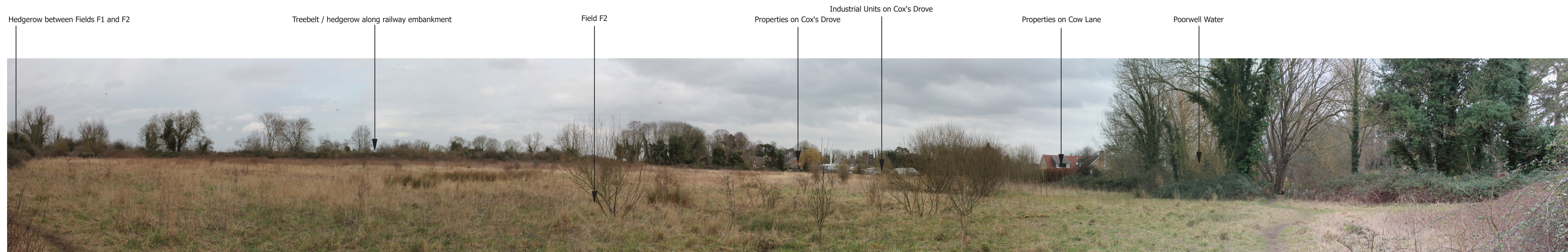
APPEAL SITE APPRAISAL PHOTOGRAPH D