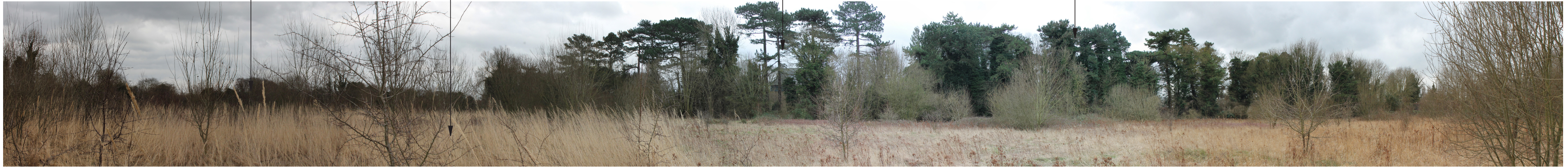
APPEAL SITE APPRAISAL PHOTOGRAPH G