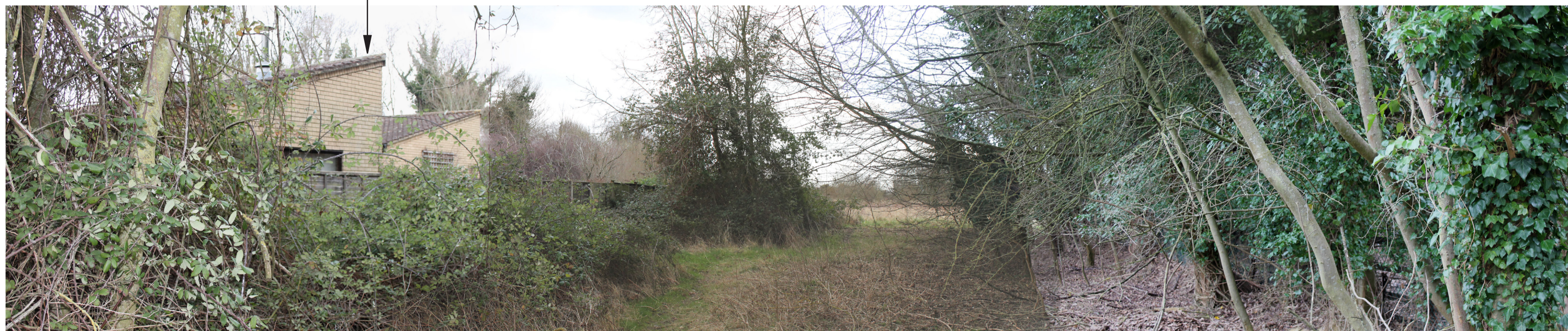
SITE APPRAISAL PHOTOGRAPH I: