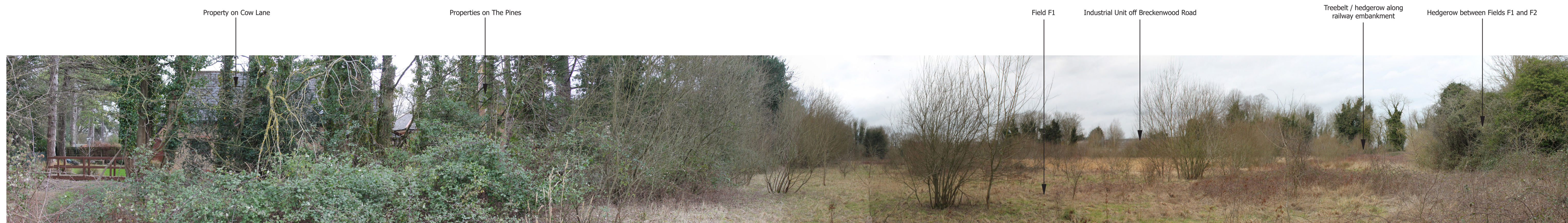
APPEAL SITE APPRAISAL PHOTOGRAPH E