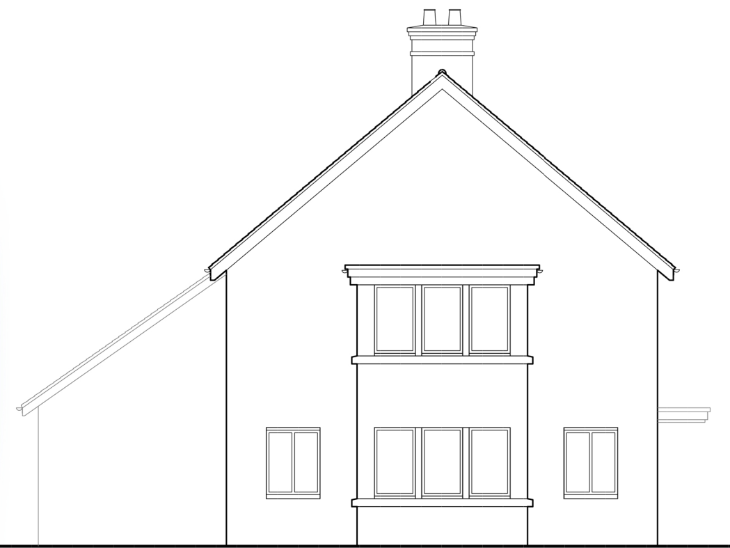
SIDE ELEVATION 1