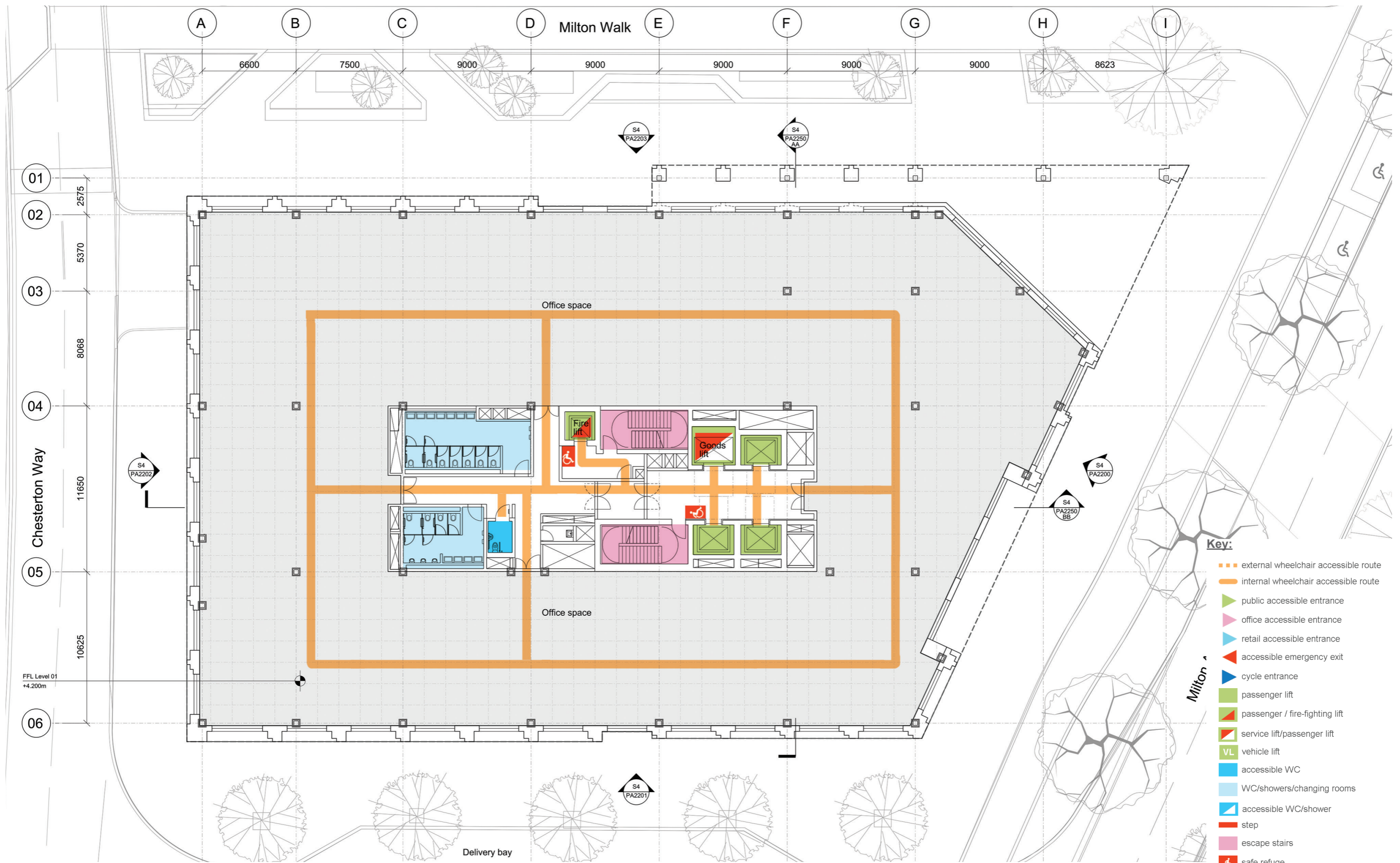
Fig.4 One Milton Avenue - Level 01 | access overlay.