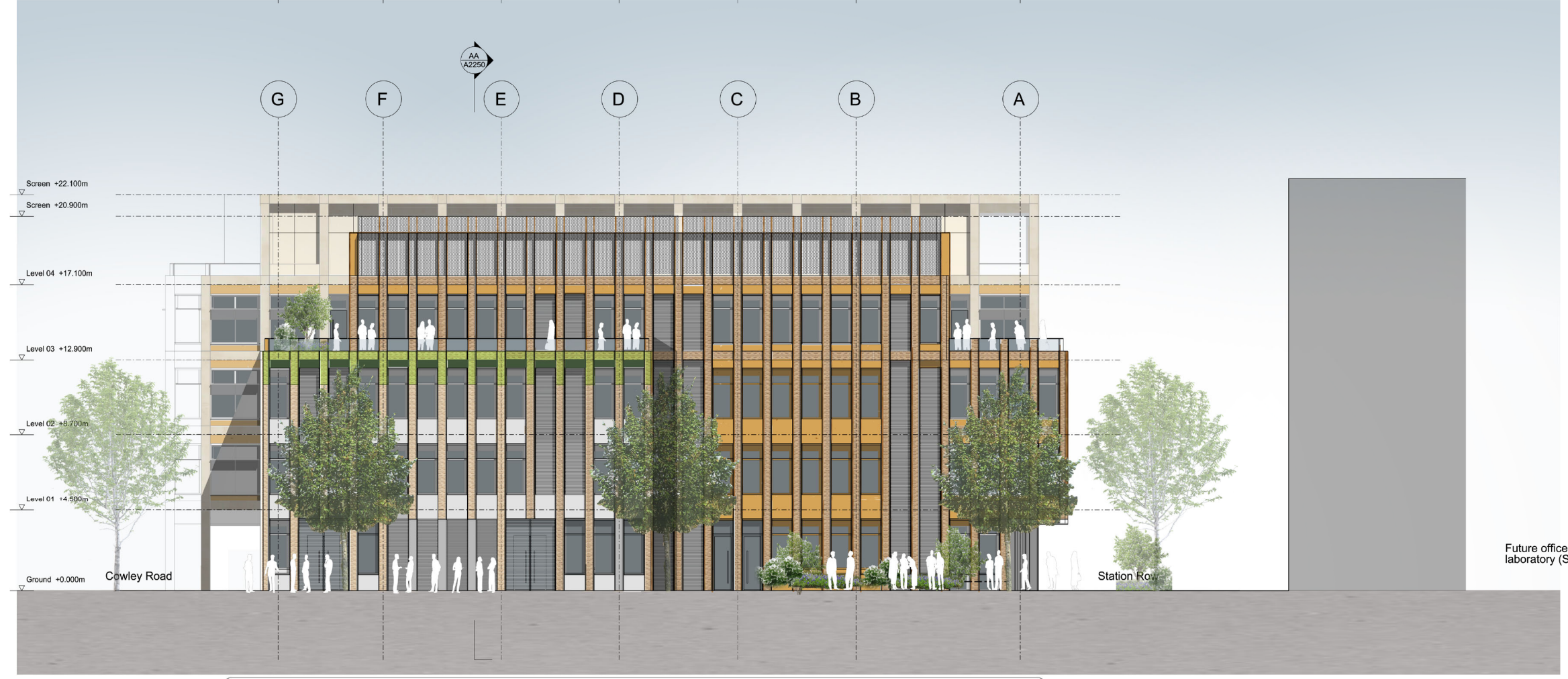
3 Station Row S7 laboratory Illustrative rendered elevation - please note planting is indicative, refer to landscape architect's plans for location and details