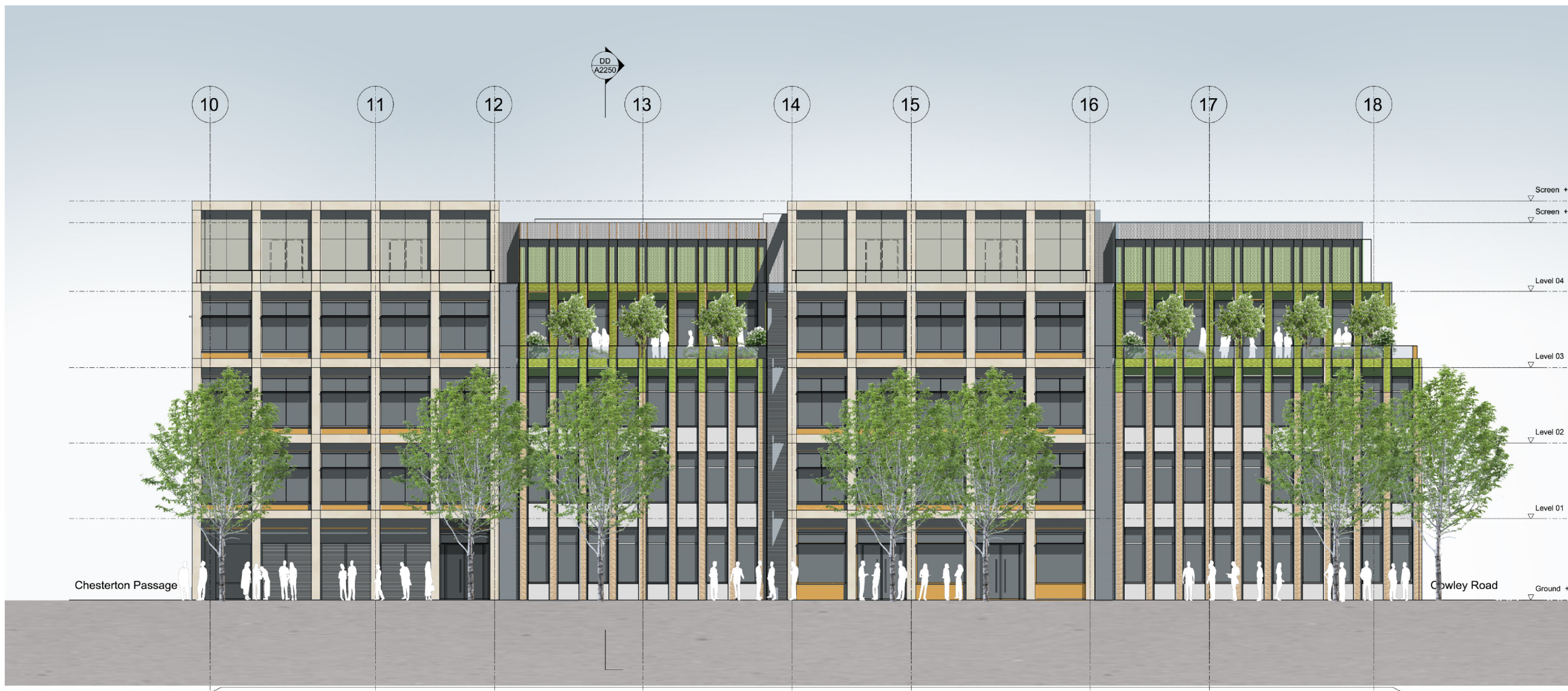
Illustrative rendered elevation - please note planting is indicative, refer to landscape architect's plans for location and details

Project No. 1818 Draw No. PA2202 Rev No. 01