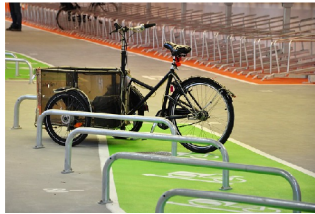
Cargo and recumbent stands