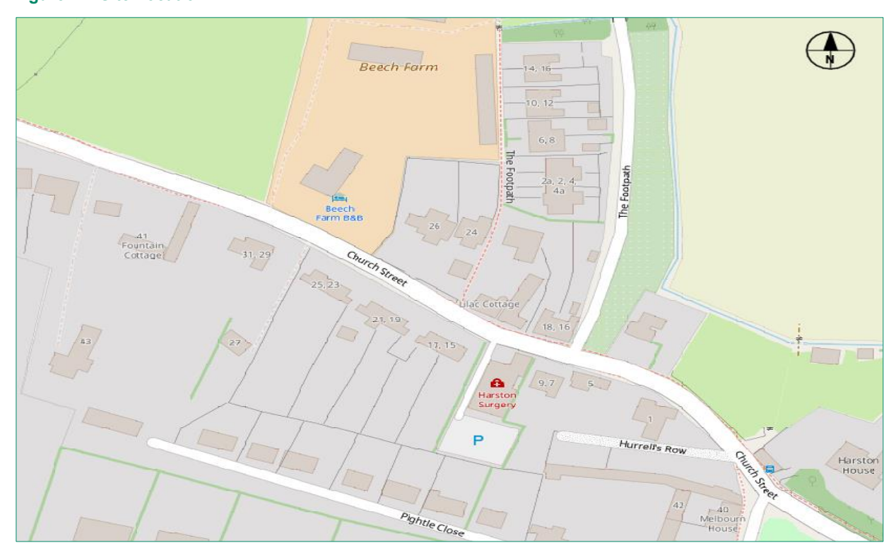
Figure 2-1 Site Location