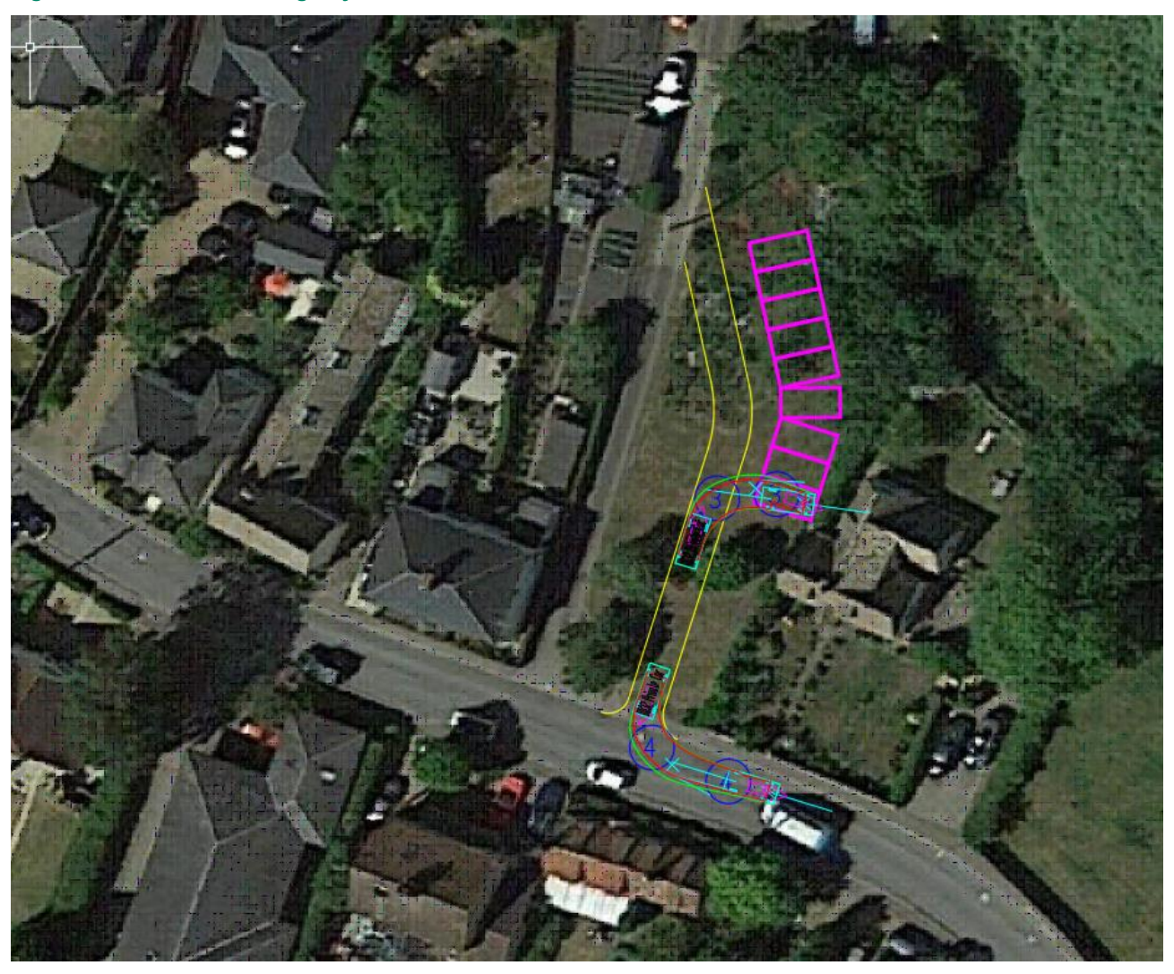
Figure 2-5 Additional Parking Bays