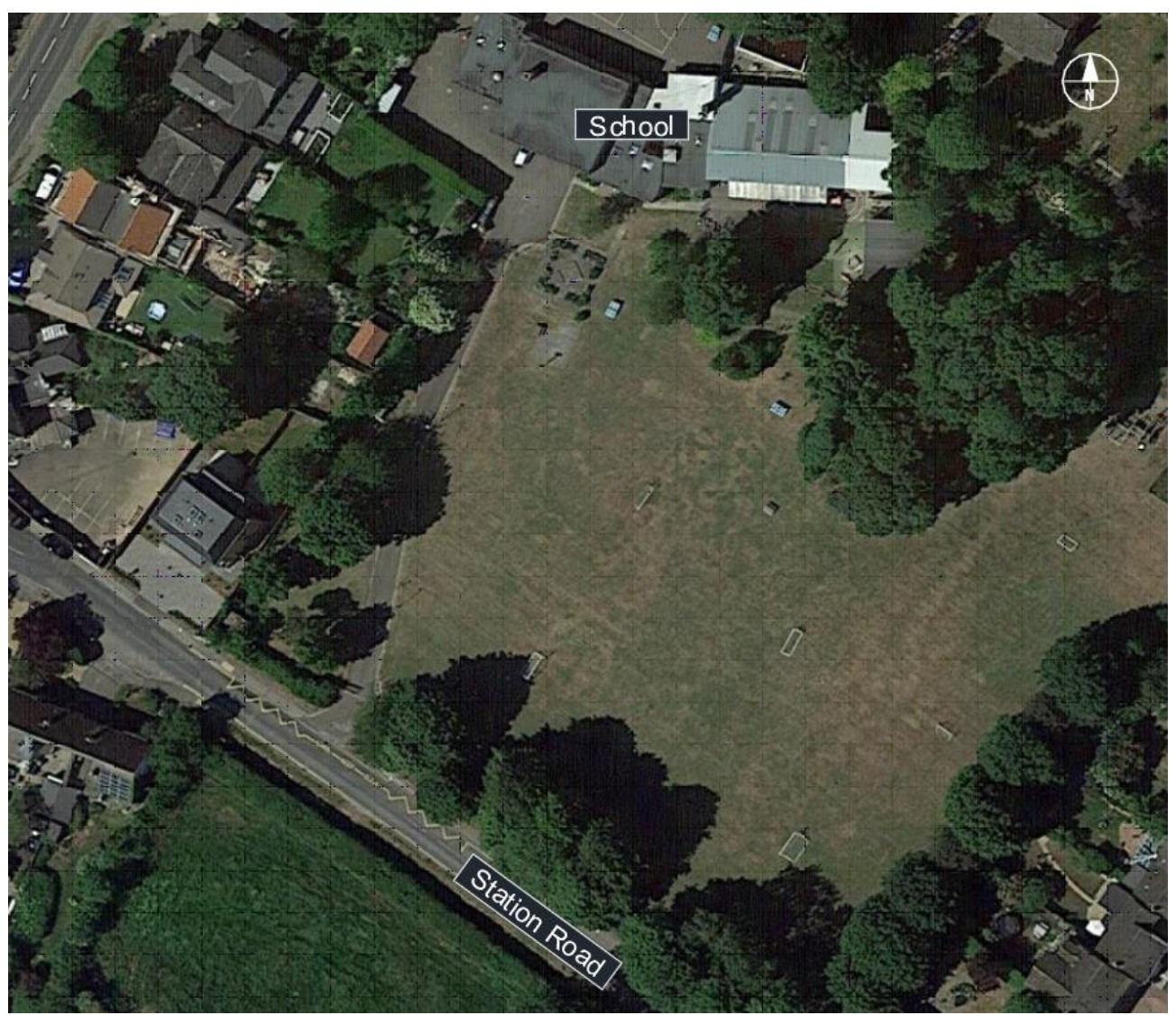
Figure 3-1 Site Location

3.1 Harston & Newton Community Primary School and its location on Station Road is shown in Figure 3-1.